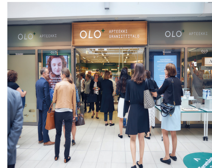
Successful opening of the first Olo apteekki (pharmacy) in Finland in the capital Helsinki on 3rd September 2019.

"Even on an international scale, our partnership model is unique, does not only provide customers with medical care, but also with preventive healthcare. The goal of the chain is to act as a local full-service point for